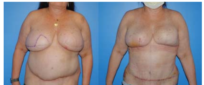
Figure 4: One year post-operatively from reduction of the bilateral reconstructed breast mounds the patient was happy with the size of the reconstruction, however the right (non-radiated) reconstructed breast had descended and the left reconstructed breast mound stayed in the elevated position. The patient chose to proceed with right breast mastopexy and additional reduction of the right breast mound.

to match the pre-operative breast size. The largest silicone implant available is 800 cc while some mastectomy specimens in patients with high BMI exceed 1000 grams. Autologous flap reconstruction also gives patients with a higher BMIs the ability to change their overall body shape and lose weight. We commonly encounter many patients who have been given a new diagnosis of breast cancer and state, “I did everything right my whole life... I don’t smoke, I don’t drink alcohol, etc.” and often a feeling of powerlessness or “unluckiness” ensues. We have found in a subset of patients with a high BMI that safe and