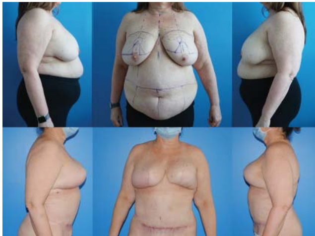
Figure 7: Before and after comparison photographs of initial presentation and final result. Pre-operative photograph of 51 year old female with left breast cancer and right breast AHD. Height 5'6" Weight 179 lbs. BMI=28.9. The patient's waist reduced in size from 48 inches to 33 inches.

educated weight reduction preoperatively and postoperatively empowers patients regarding their future breast cancer risks, body image, and overall health. New analysis from Harvard of the Pooling Project of Prospective Studies of Diet and Cancer (DCPP) demonstrates a direct relationship between the amount of weight lost and the reduction of breast cancer risk. In this study, women over fifty who sustained weight loss of greater than 20 lbs had a 26% reduction in breast cancer risk. The analysis excludes women on HRT [5]. The effects of obesity on