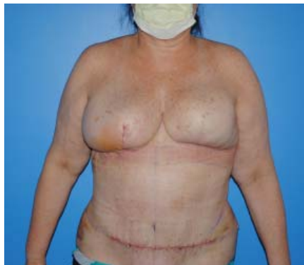
Figure 6: Timeline of weight loss after initiation of high protein diet and autologous flap reconstruction. The final body mass index of the patient was below.