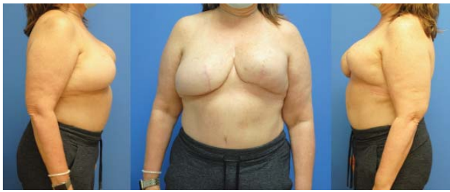
Figure 5: One week post-operatively from right breast mastopexy reduction and final abdominal donor site scar revision. The right inframammary fold was elevated and the flap was debulked superior to the inframammary fold to allow contraction of the fold. Raising an inframammary fold is challenging when the breast mound is heavy and or the abdominal girth is heavy as the fold tends to drop. Radiation has the effect of elevating the inframammary fold.